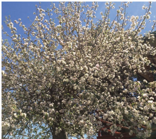
Old Apple Tree by South Building